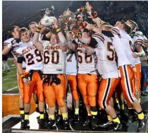
Coldwater's senior class played 60 games in a remarkable high school career, capped by a hard-earned state title.

"The kids are resilient," he said then. "Last year was disappointing, for sure, but by the time we got back home on the bus they had pretty much recovered and were ready to go on with their lives. Basketball season started on Monday.