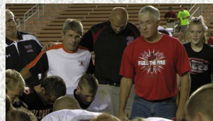
Coldwater and Hicksville teams and their coaching staffs meet for a post-game prayer.

Last week I reported that the Cavalier program is on the brink of winning their 500th game and that if they remained undefeated it could happen against rival St. Henry. Actually the soonest they could reach 500 is versus Anna in Week 7. (Which goes to show that Excel is only as good as the guy who is using it.)